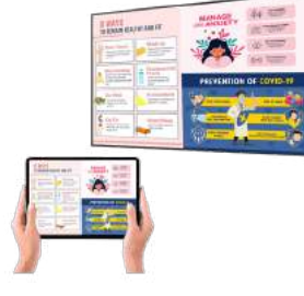
Connection Design Built-in